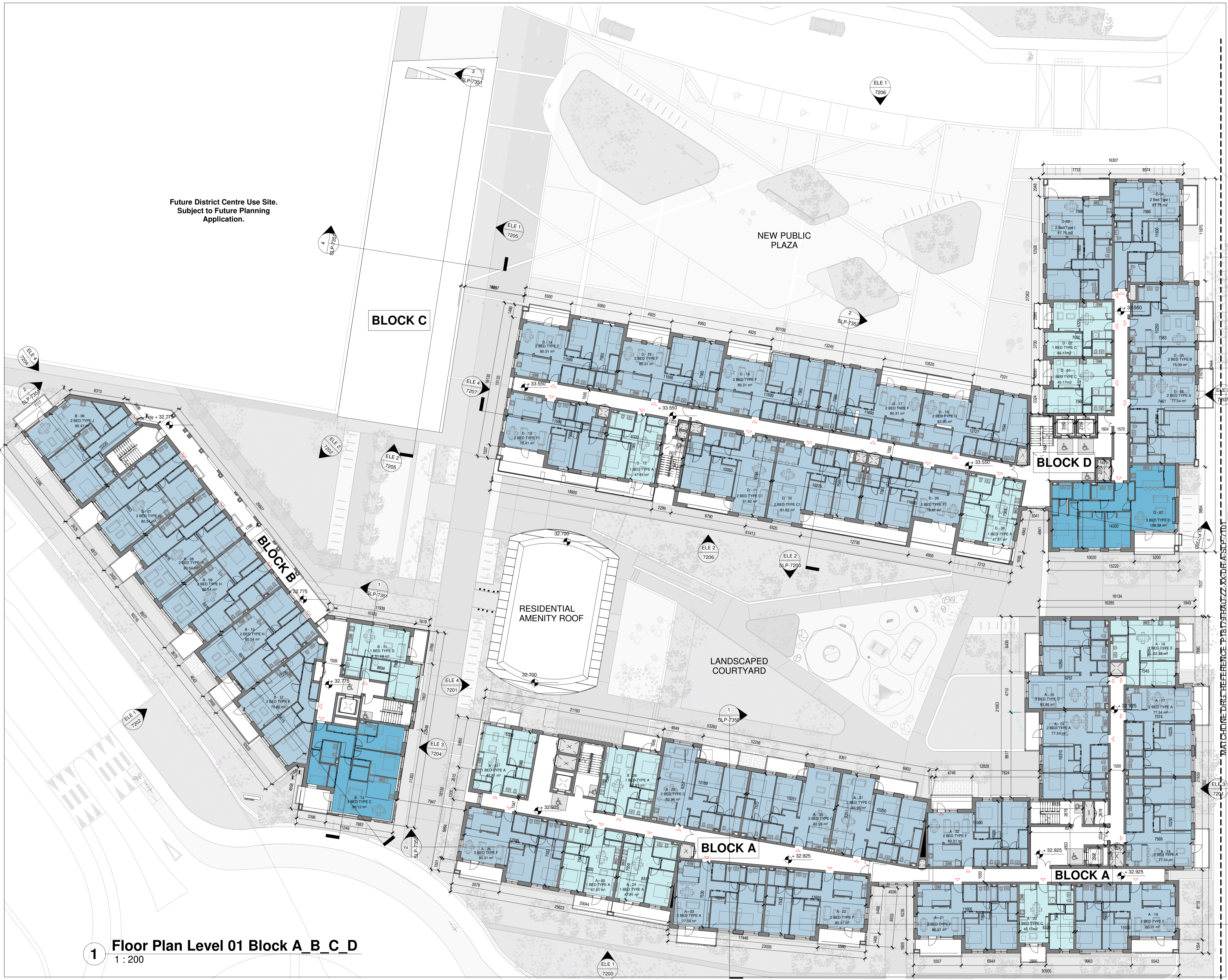
1 Floor Plan Level 01 Block A B C D 1 : 200